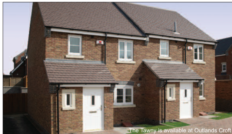
The Tawny is available at Outlands Croft

Whichever property you choose, it will benefit from a great location in an established residential area, with Hinckley town centre's bustling high street, regular markets, restaurants, theatres and cinema all within easy reach.